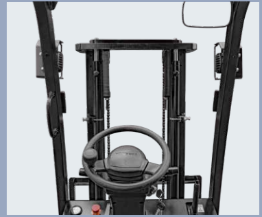
Wide view mast

/ The optimized design of the wide-view mast and the low dashboard enable a wide front view and higher safety, and minimizes the blind view to the greatest extent. / The emergency power-off switch complies with European safety standards. / The electronic and hydraulic overload protection comply with safety regulations. / OPS system(Opt.) can improve safety greatly.