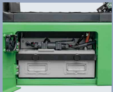
Lithium battery pack