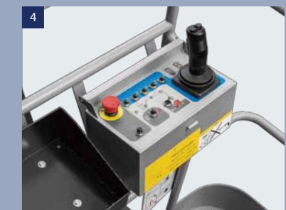
Basket control box: each action of the device can be controlled through the control box to quickly reach the working area, and the control is simple and easy to understand