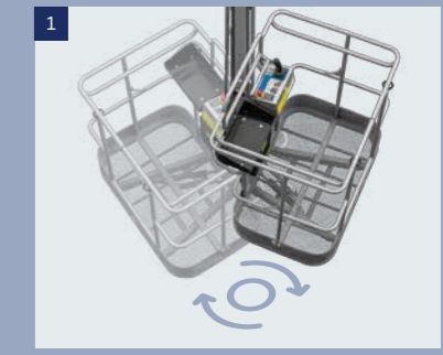
Basket: can be rotated left and right at an Angle of 140°