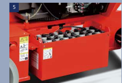
Standard tracking battery: Reduce 40% of the charge time, raise 50% of the life time