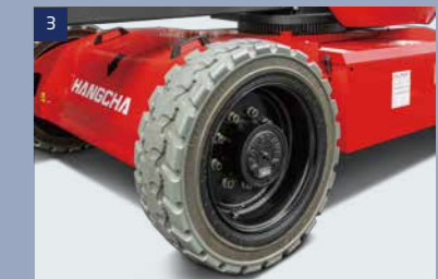
Tires: foam-filled tires with good off-road performance